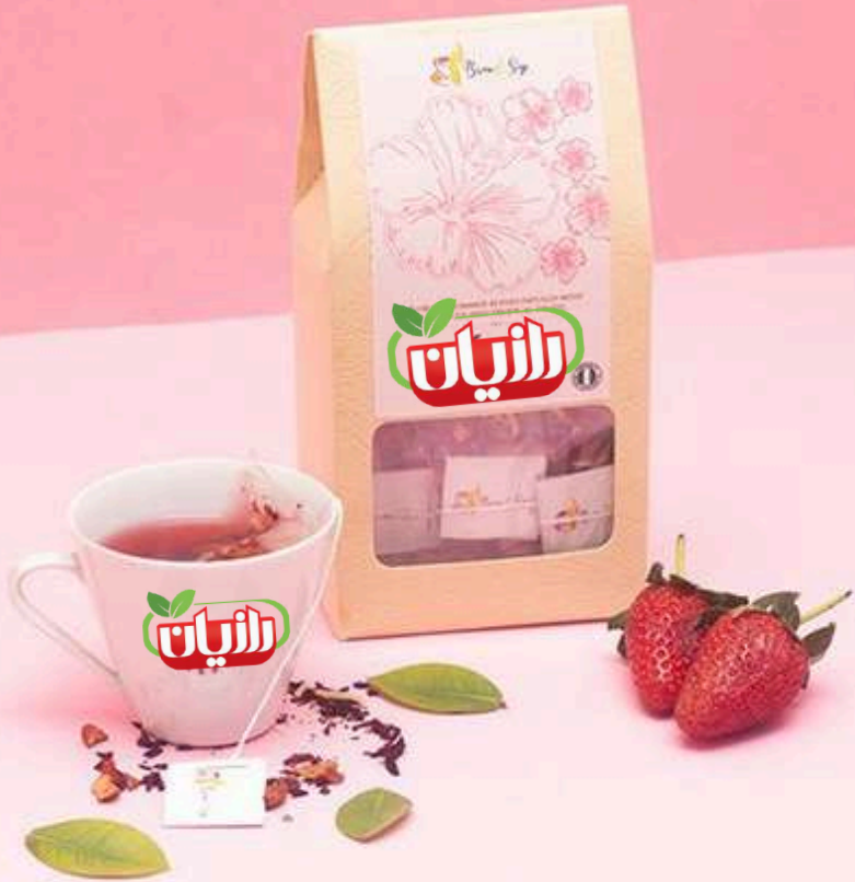
Mixed berry tea